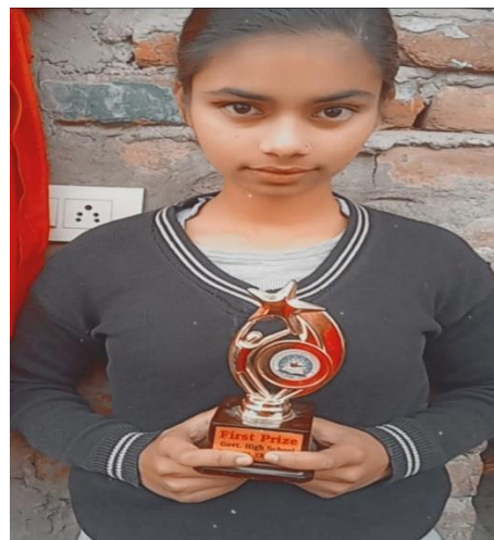
First prize in school sports