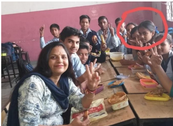
Sharing lunch with fellow student and teacher and taking part in mehndi