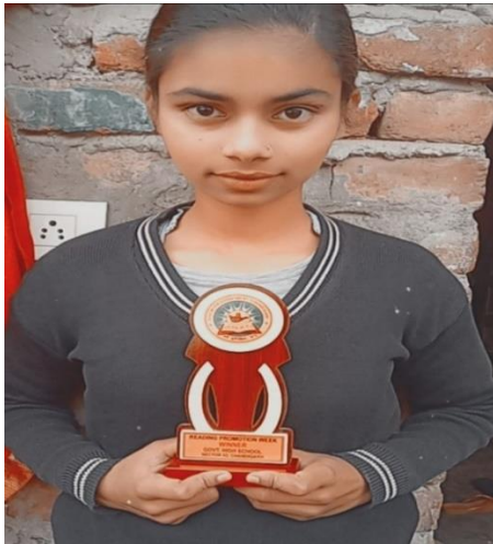
First prize in Hindi reading